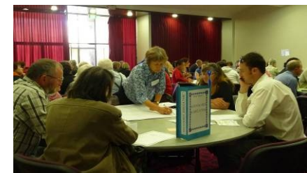
Participants discuss the local issues at the workshop held in September 2009