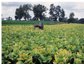
Supporting local food access projects

Some people in Macarthur are food insecure. This means that they may run out of food and do not have money to buy more, eat poor quality food, have very limited food choices or constantly worry about not being able to feed their family