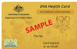
A Repatriation Health Card embossed with: TPI, TTI, EDA, War Widow or War Widower